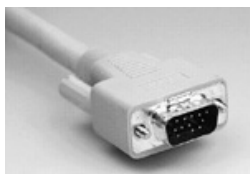
(Connection cable side)